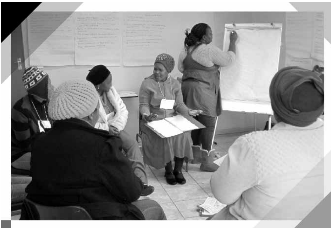
Training of paraprofessionals (community health workers) to deliver the programmes is a key component of Parenting for Lifelong Health.