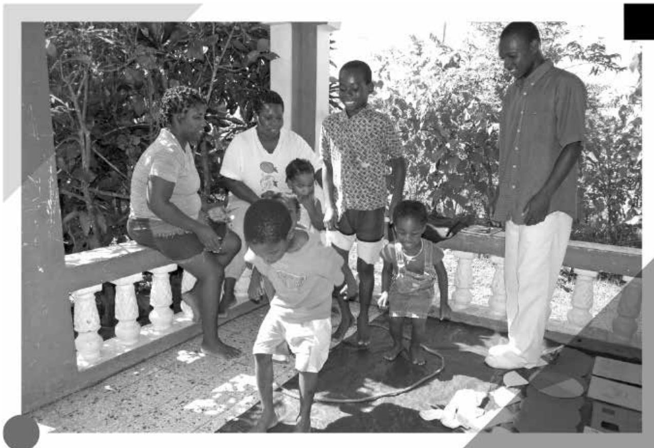
Despite the challenges, Jamaica remains one of the few countries to have developed a national parent support policy.

expanded to become the Parenting and Community Intervention Co-ordinator. Research activities in parenting were also initiated to inform decisions on parenting; these included development of a parenting strategy (2005), mapping of existing parenting programmes across the country, and an audit of parenting education material (2006).