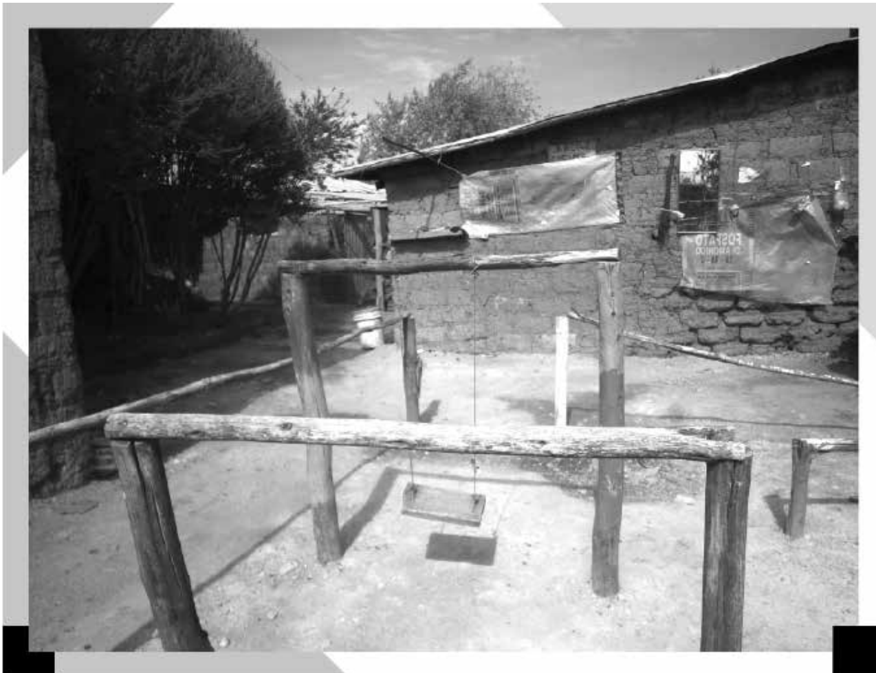
The improvement in household living conditions included having a place in the yard outside where the children could play.