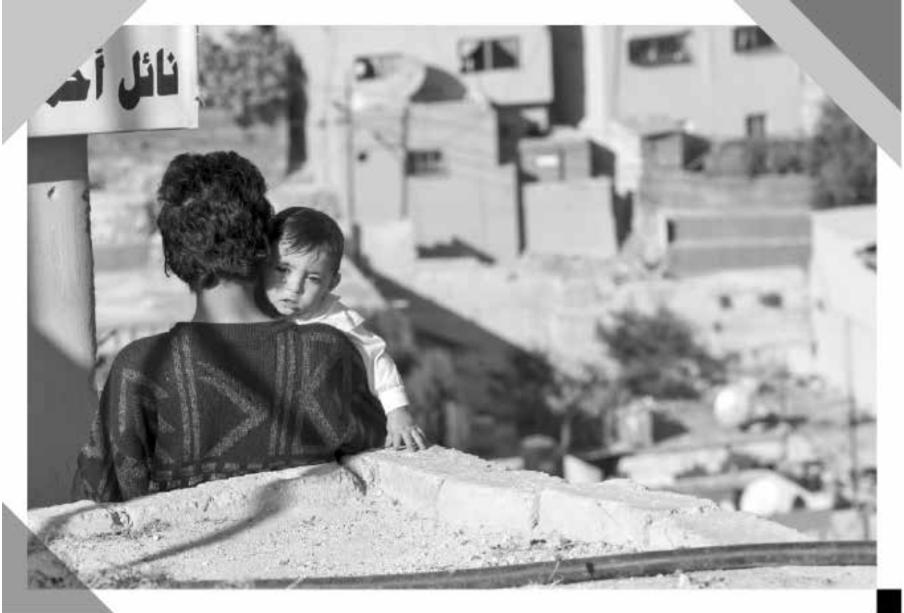
Parenting that is supportive, proactive, responsive and involved promotes children's positive adjustment.