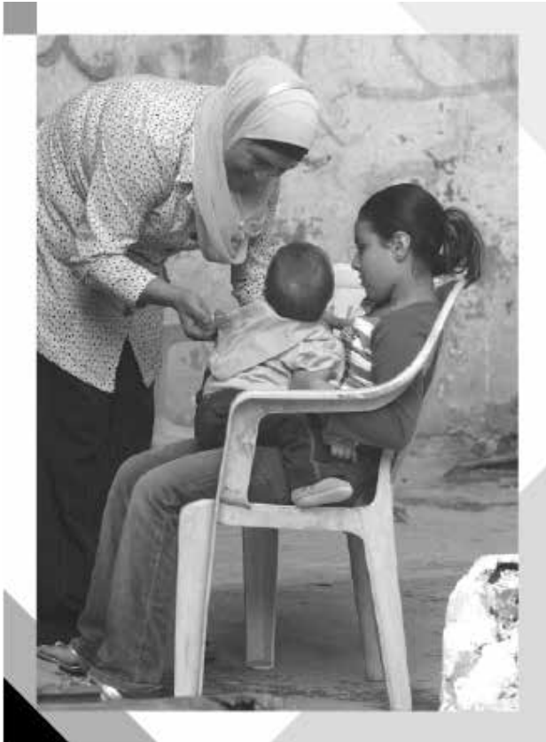
The Better Parenting Programme in Jordan is a nationwide programme aimed at empowering parents and caregivers to provide a stimulating, loving and protective environment at home.

facilitators' manuals included session guides, printed booklets, flip charts, audio-visual materials, posters, parent activity sheets, and recommended take-home reading materials for the participants. Local facilitators had the flexibility to use all or a subset of the lessons and to follow time schedules that worked best for the participants. Some facilitators implemented the programme over a period of 3–4 consecutive days, some conducted the training once a week for a month, and some conducted the training twice a week for 2 weeks.