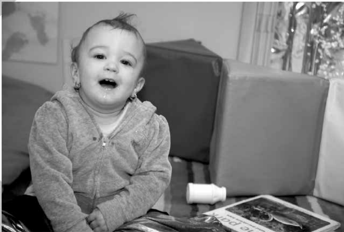
The Nurse–Family Partnership is an intensive programme for first-time, socially disadvantaged mothers. It begins prenatally and extends until the child is 2 years of age.