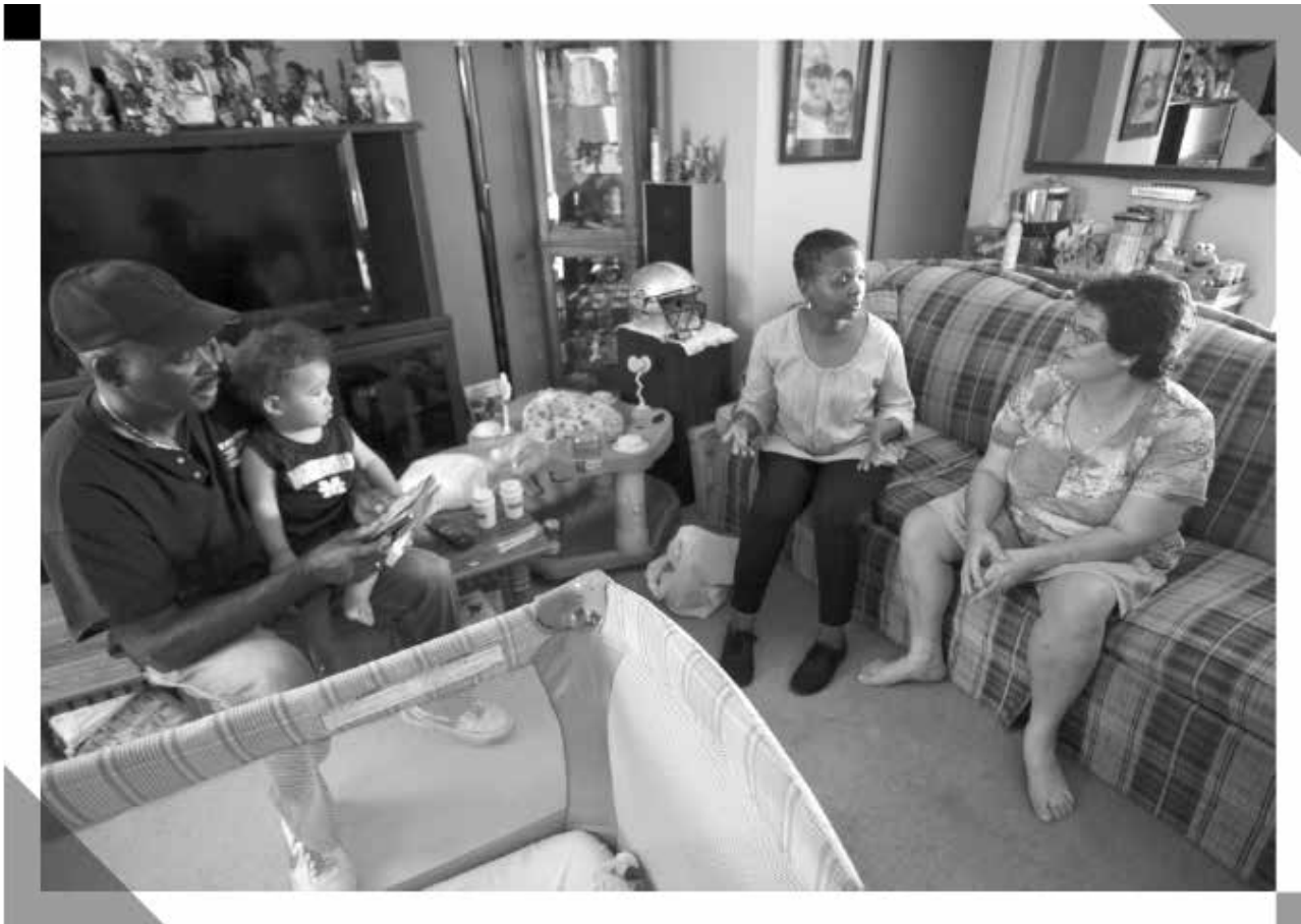
The implementation of the Home Visiting Program in USA has been an exciting, rapid and heavy lift for many states and local communities.