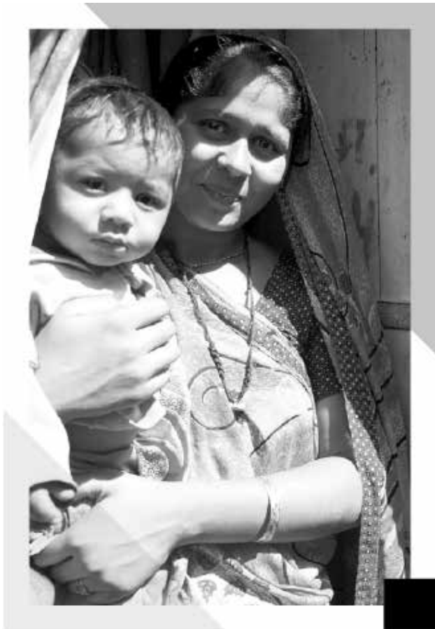
One of the Evaluation Challenge Fund's objectives is to develop a culture of learning by strengthening the capacity of organisations working in violence prevention to work in partnership with research teams.