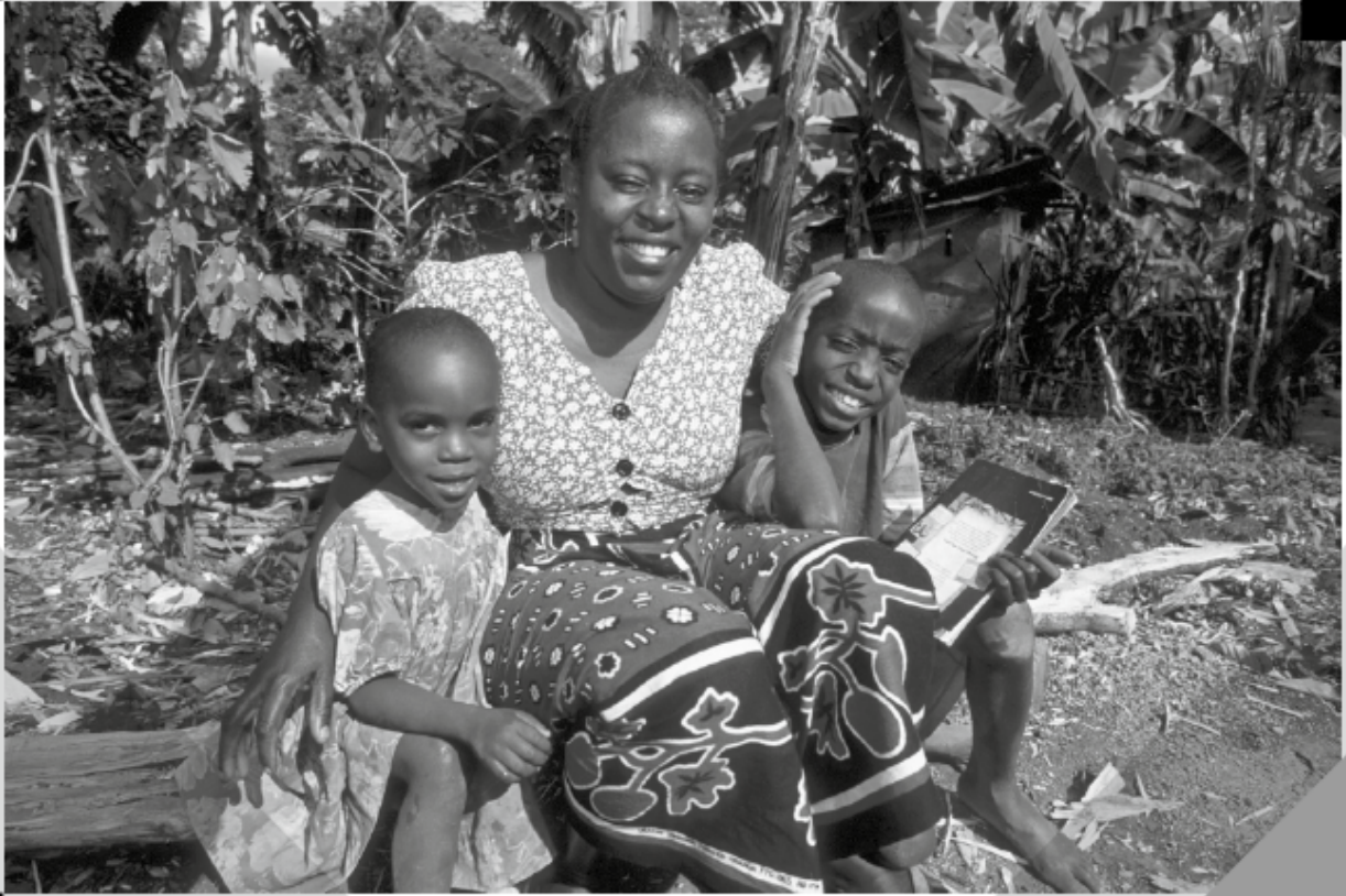
Responsive parenting refers to the ability of parents to meet the needs of their children mentally, emotionally and physically through the critical few years after birth.

'This edition explores the approaches and evidence for the effectiveness of a range of programmes that have been developed to educate and support parents in becoming more responsive to their children.'