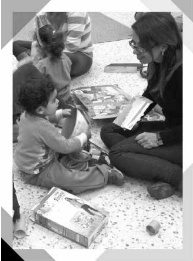
Mothers reported dedicating more exclusive time to the child, some saying this helped to strengthen their bond.

1996) and which is characterised as driven, serious, lacking in joy and frequently morbid. PTP tends to involve simple defences such as identification with the aggressor, identification with the victim, displacement, undoing and denial, and tends to be developmentally regressed (Terr, 1981; Cohen et al. , 2010).