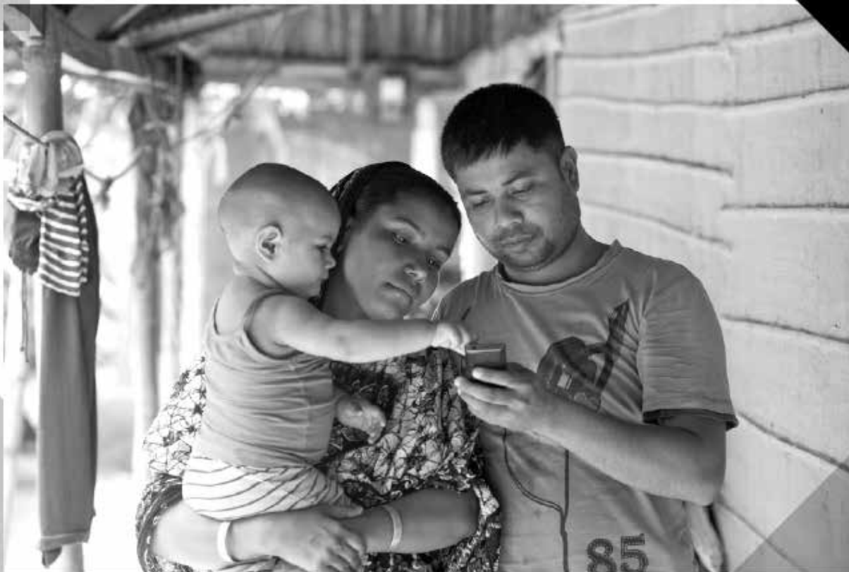
The MAMA messages facilitate positive parent-child interactions and attachment: touching, talking, caring for and playing with children.

You can stay close by making some time for each other every day, and suggest that while disagreements are normal, having them when the child is not around is preferable: